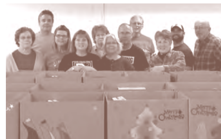
Annual Christmas Blessings Project Volunteers served 113 seniors - Christmas 2016.