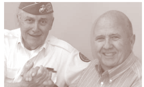
Marine Corps. Honor League visits BOGADS

A supportive and caring environment for memory impaired adults who would benefit from a structured day setting. Our goal is to provide meaningful services that enrich the lives of older adults, families and caregivers. Payment is made on a cost-share basis.