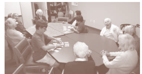
Teen volunteers enjoy a game of cards with Guests at Be Our Guest Adult Day Service

A supportive and caring environment for memory impaired adults who would benefit from a structured day setting. Our goal is to provide meaningful services that enrich the lives of older adults, families and caregivers. Payment is made on a cost-share basis.