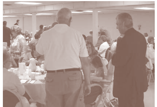
Funds from the DSA support the CCA Senior Appreciation Mass & Luncheon

LCCC received a grant from the Sisters of the Precious Blood to assist probationers and parolees to continue services at LCCC after government funding for mental health and substance abuse has been exhausted. This population often struggles to find services to support their transition from incarceration back into community life. This gift allows